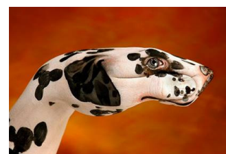
by the Handpainter